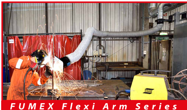
FUMEX Flexi Arm Series

Using modern parallelogram technology, the arm is easy to move and yet retains its position once placed. The extractor hood can be angled more than 110 degrees in all directions.